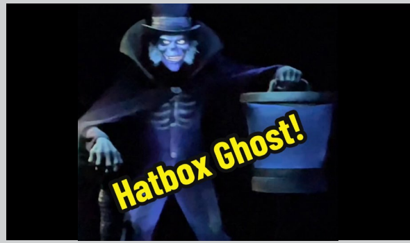
Now, when Disney says "by the end of November" they literally mean it!! Welcome the Hatbox Ghost to Haunted Mansion! If you are wondering WHO he is and where he comes from..take a peek HERE!!