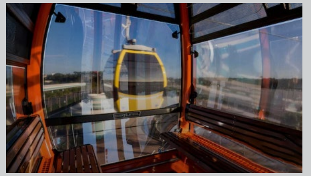
Never a dull moment when we have "friends" on a Skyliner Ride. This is a classic....ENJOY YOUR BURGER!