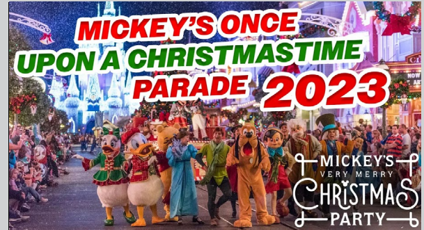
Here is the playlist of the entire party's shows and fireworks! So beautiful!! Can't be there in person? Watch and enjoy all the things of the holidays at Magic Kingdom.