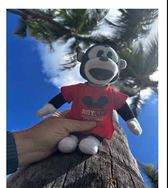
Those Bonaire trees were calling my name, but William had a tight hold on me.