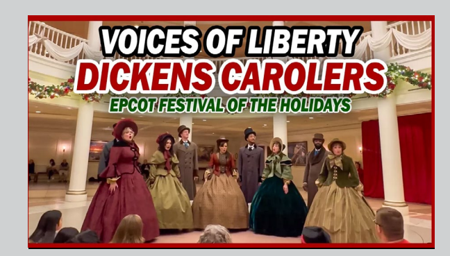
Holidays are alive in Epcot as well. Enjoy Voices of Liberty caroling!