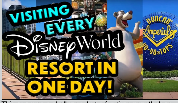
This one was a challenge, but a fun time nonetheless. Would you try it? Just for fun? I would probably turn it into a pool bar crawl....but that's me.